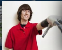
3D Printing in Healthcare